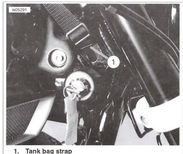
Figure 2. Tank Bag Rear Strap