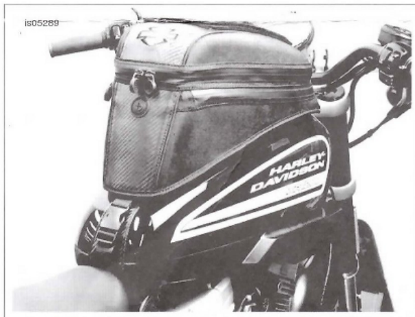
Figure 1. Tank Bag Installed