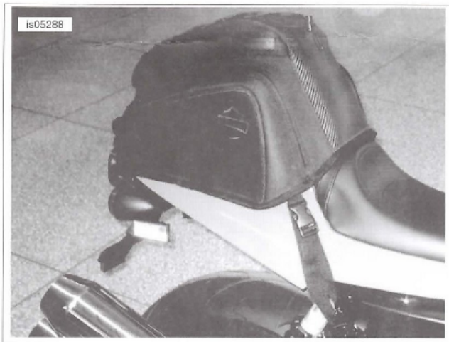
Figure 1. Mounted Tail Bag